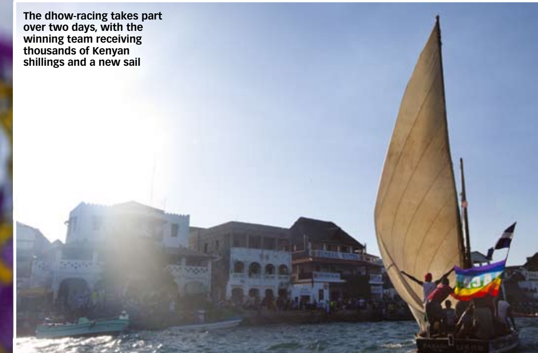
The dhow-racing takes part over two days, with the winning team receiving thousands of Kenyan shillings and a new sail