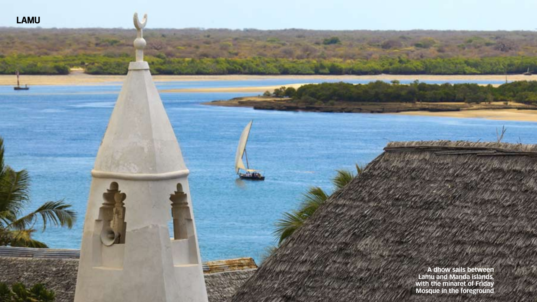
A dhow sails between Lamu and Manda Islands, with the minaret of Friday Mosque in the foreground