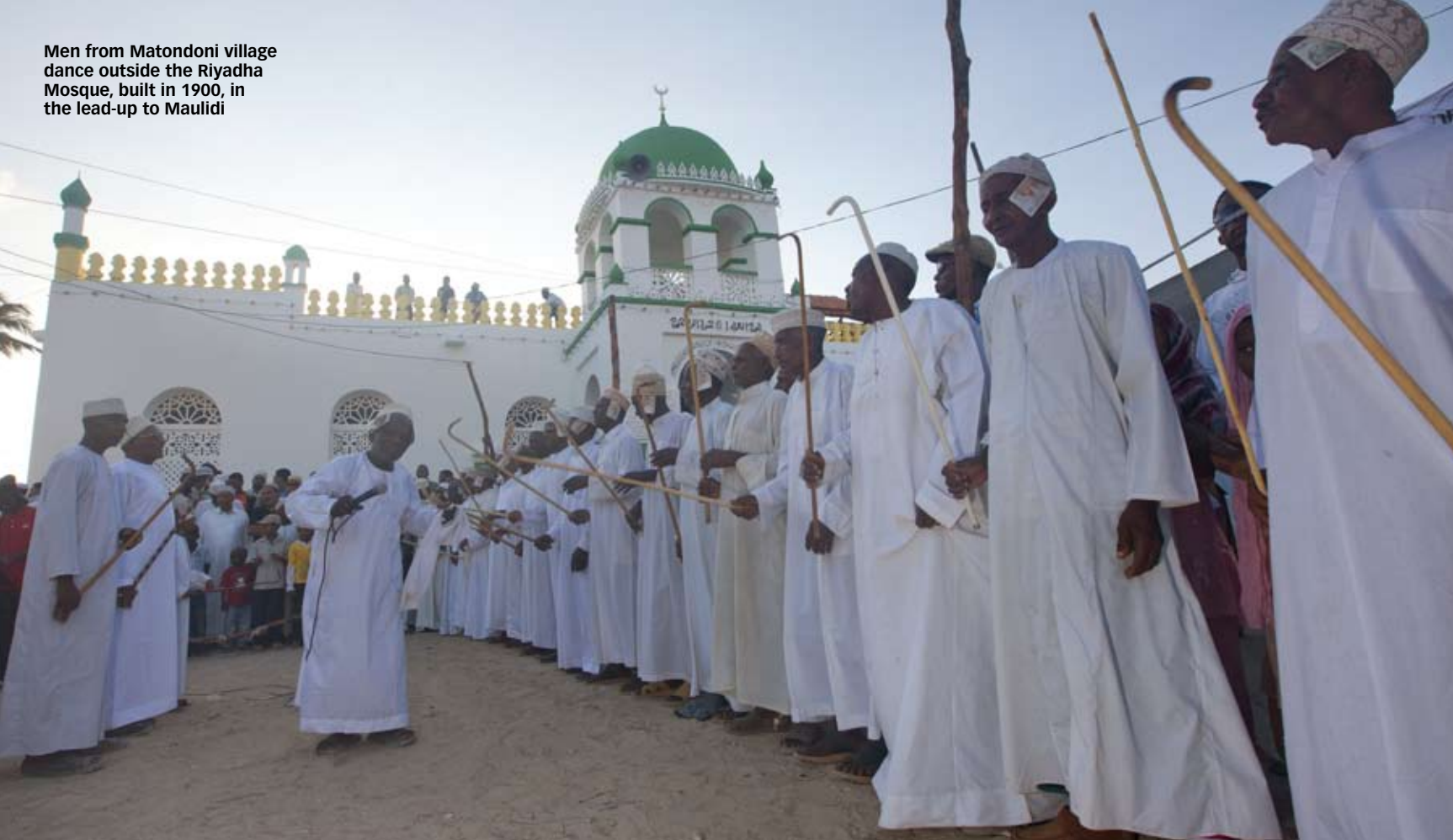
Men from Matondoni village dance outside the Riyadhha Mosque, built in 1900, in the lead-up to Maulidi