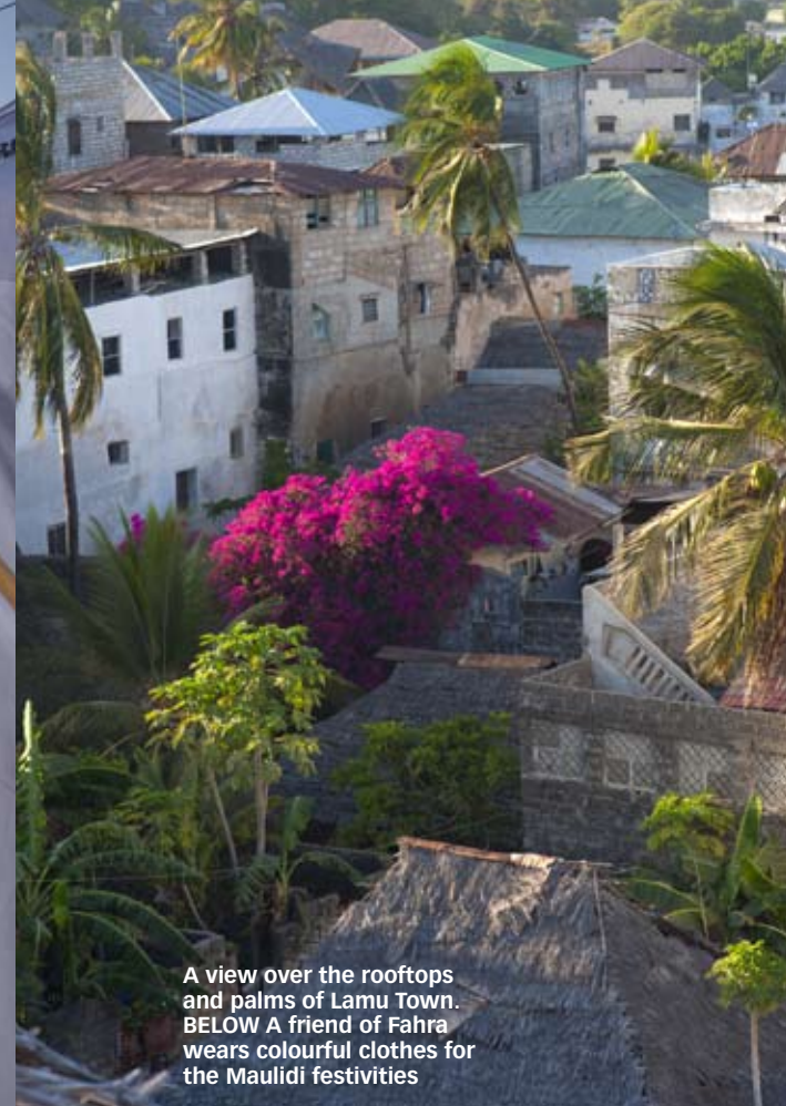
A view over the rooftops and palms of Lamu Town. BELOW A friend of Fahra wears colourful clothes for the Maulidi festivities