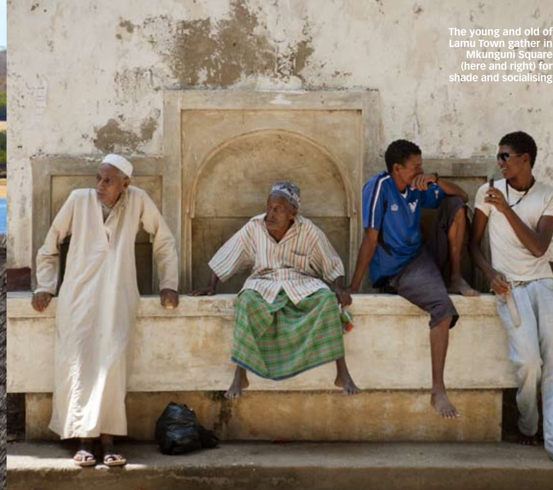
The young and old of Lamu Town gather in Mkunguni Square (here and right) for shade and socialising