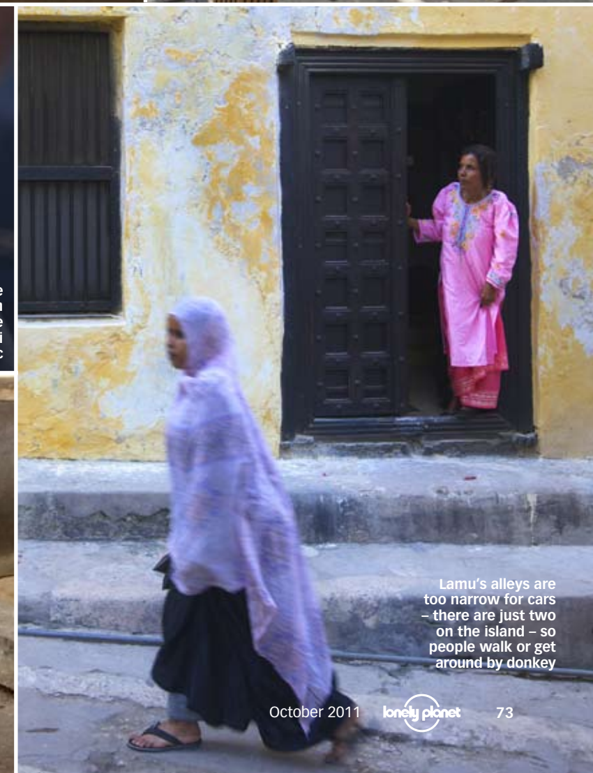
Lamu's alleys are too narrow for cars – there are just two on the island – so people walk or get around by donkey